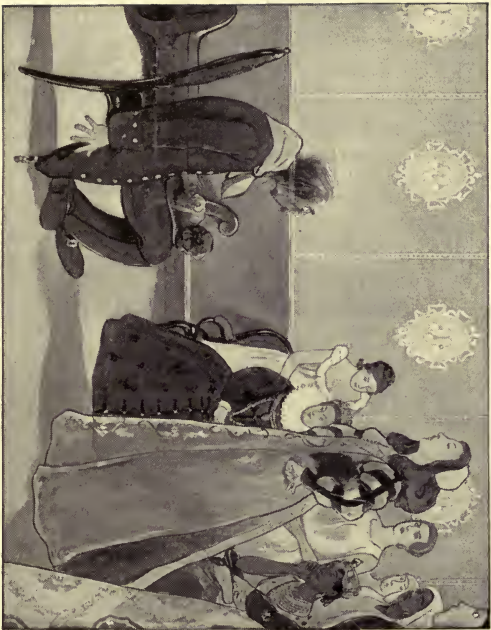
CAPTAIN KIDD CONSENTS TO BE CROSS-EXAMINED BY PORTIA